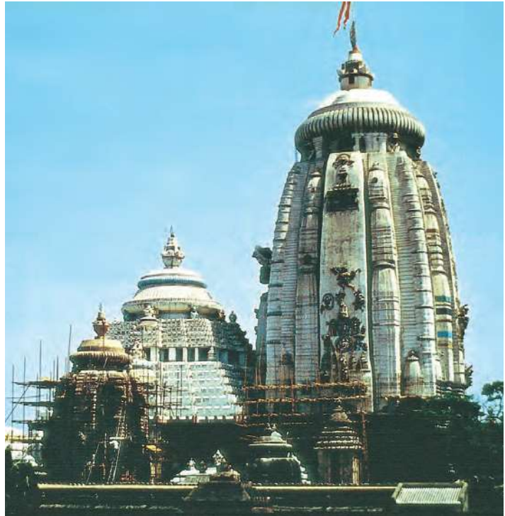
Fig. 3 Jagannatha temple, Puri.

These cultural traditions were closely linked with the ideals and aspirations of rulers. From about the eighth century, most of the present-day state of Rajasthan was ruled by various Rajput families. Prithviraj (Chapter 2) was one such ruler. These rulers cherished the ideal of the hero who fought valiantly, often choosing death on the battlefield rather than face defeat. Stories about Rajput heroes were recorded in poems and songs, which were recited by specially trained minstrels.