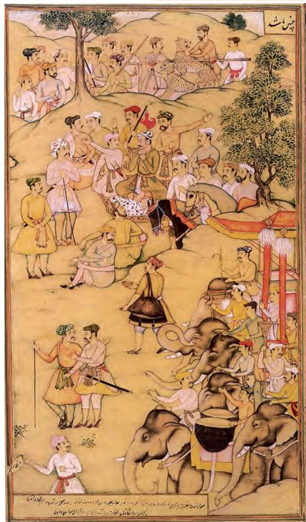
Fig. 7 Akbar resting during a hunt, Mughal miniature.

Another region that attracted miniature paintings was the Himalayan foothills around the modern-day state of Himachal Pradesh. By the late seventeenth