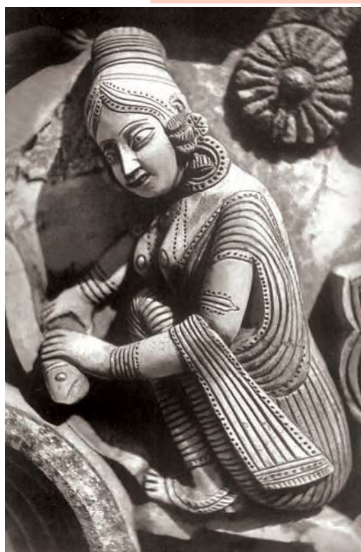
Fig. 14 Fish being dressed for domestic consumption, terracotta plaque from the Vishalakshi temple, Arambagh.

Brahmanas were not allowed to eat non-vegetarian food, but the popularity of fish in the local diet made the Brahmanical authorities relax this prohibition for the Bengal Brahmanas. The Brihaddharma Purana , a thirteenth-century Sanskrit text from Bengal, permitted the local Brahmanas to eat certain varieties of fish.