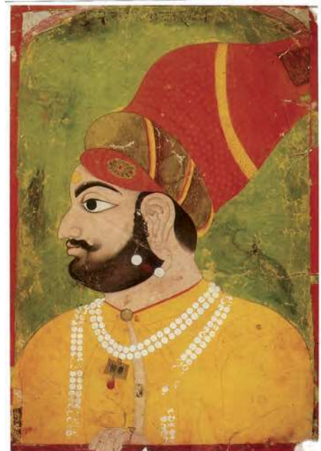
Fig. 4 Prince Raj Singh of Bikaner.