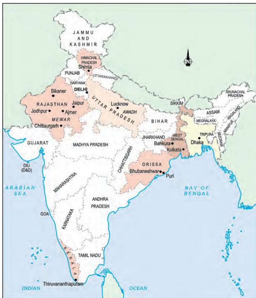
Map 1 Regions discussed in this chapter.

Did women find a place within these stories? Sometimes women are depicted as following their heroic husbands in both life and death – there are stories about the practice of sati or the immolation of widows on the funeral pyre of their husbands. So those who followed the heroic ideal often had to pay for it with their lives.